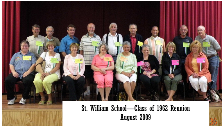
St. William School—Class of 1962 Reunion August 2009

tivities were planned on each night of the weekend. The school was open for past, present and perspective families to visit. Another similar celebration is planned for January 2010 (details on